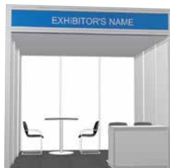
Standard Booth 9 Sq.M

* Conditions Apply. Please contact Organizer for additional information.